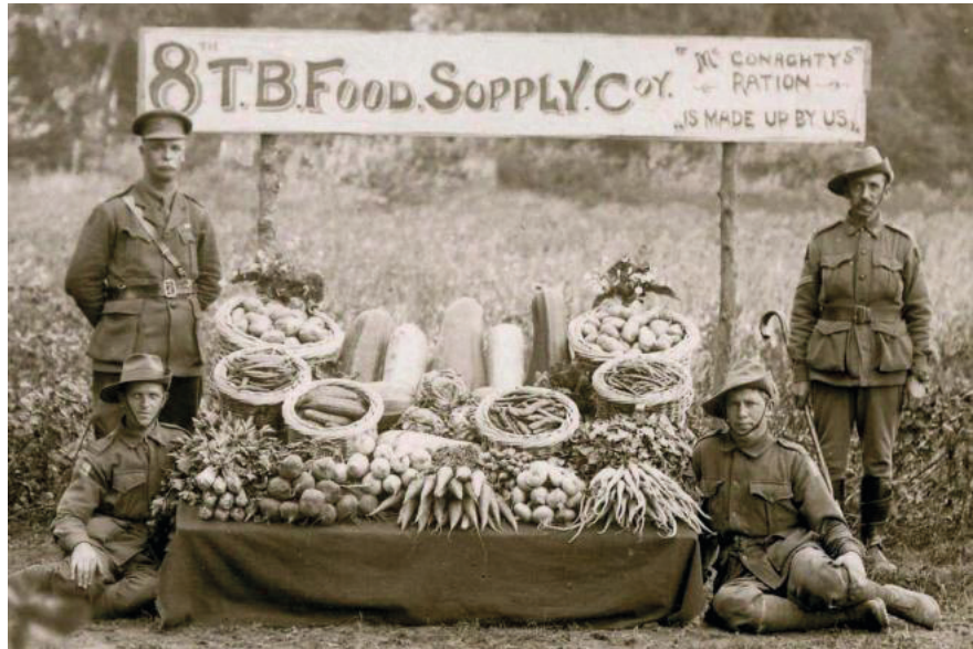
Photograph of Australian Troops with Western Front Grown Vegetables and Maconochie Joke